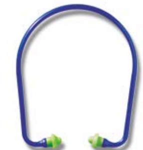
Product Code: 0114MM6600