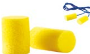
Product Code: 01PP-01-002