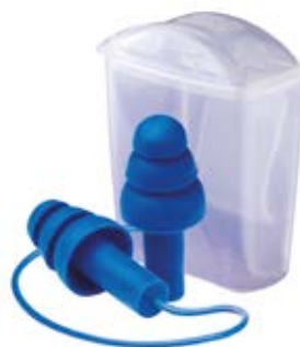
Product Code: 01TR-01-000