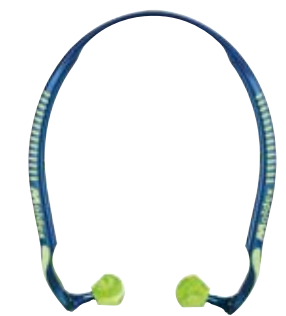
Product Code: 0114MM6700