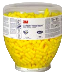
Product Code: 01PD-01-002