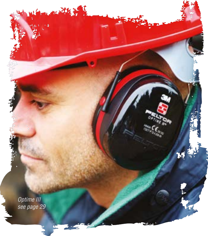
Optime III see page 29