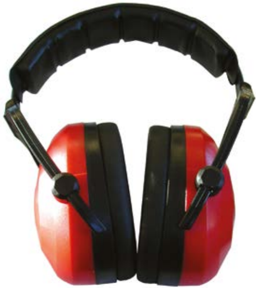
Product Code: 0114DM