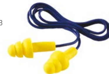
Product Code: 01UF-01-000