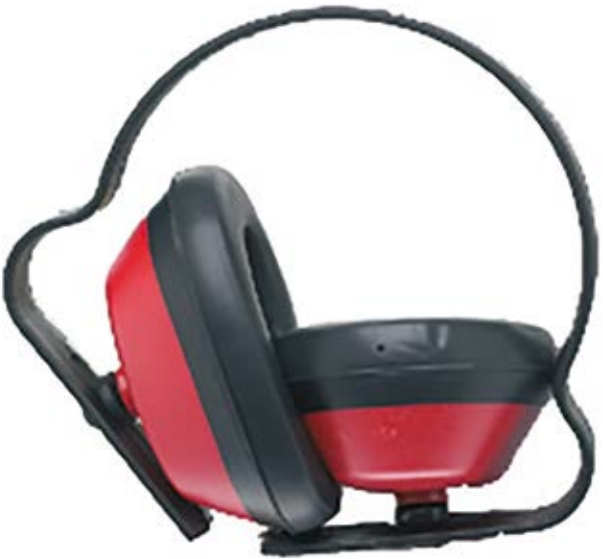
Product Code: 0114M